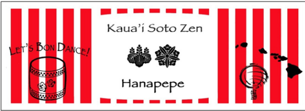
Our 2017 Bon dance towel unfolded