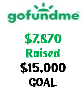
From U.S. Marine to Zen Monk

https://www.youtube.com/watch?v=L61o34CCmmo&t=18s