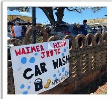
WHS JrROTC April 6, 2024 Raising money to send cadets to the D-Day celebration in France