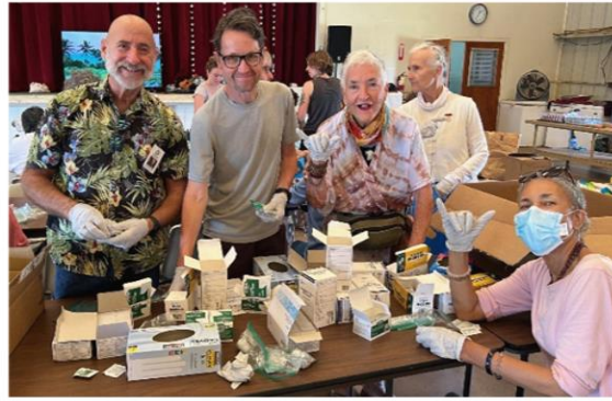
Martin Luther Kings Birthday January 15, 2024

Where OLD traditions continue because of NEW ideas!