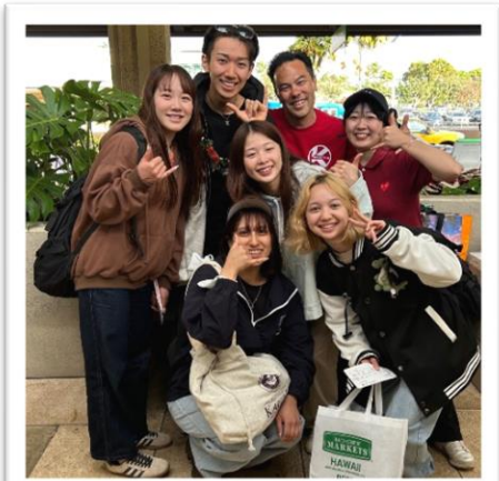
Nagoya University of Foreign Studies Study Tour, March 2024