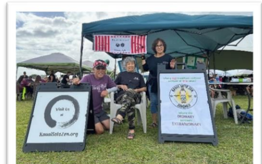
Charity Walk May 4, 2024 $3800 raised