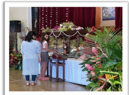
Hanamatsuri-Buddha Day April 7, 2024