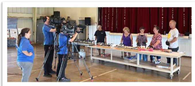
PBS-Hawaii television crew filming an episode on Flying Saucers for the series "Home is Here."