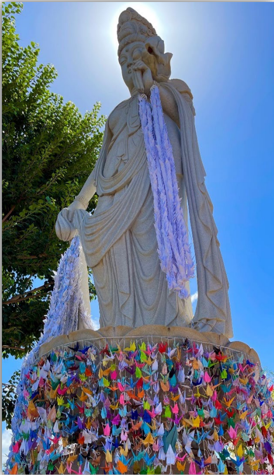
FOLD a paper crane for Peace!